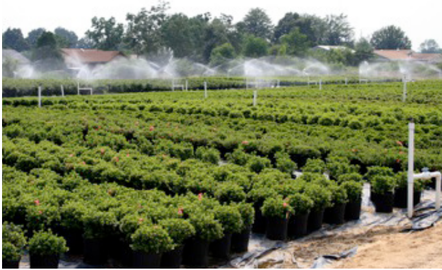
Figure 4. This photo shows two blocks of 3-gallon azaleas ( Rhododendron spp.) grouped by planting date and plant size. The plants being irrigated in the background were planted in 3-gallon containers 12 months before this photo was taken and are two to three times the size of the plants in the bed closest to the camera (not being irrigated) that were planted four months prior to this photo being taken. Grouping plants based on water needs can reduce root pathogens in nursery production.

When organizing new production areas, growers should think about grouping plants together by water-use characteristics. These water-use characteristics can be based on plant age, species or container size.