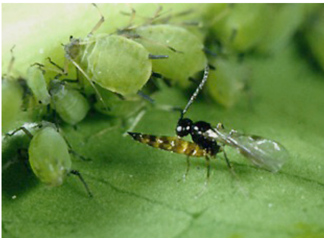
Figure 2. Aphid wasp ( Lysiphlebus testaceipes) adult emerging from aphid mummy.

Help with natural enemy identification can be found at www.nysaes.cornell.edu/ent/biocontrol/index.php , which shows many different types of beneficial insects and their method of bio-control. For example, one of the most prevalent insects in ornamental production is aphids. A predator of aphids, the aphid wasp, is shown in Figure 2.