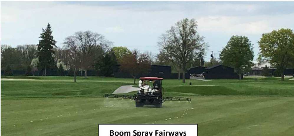
Boom Spray Fairways