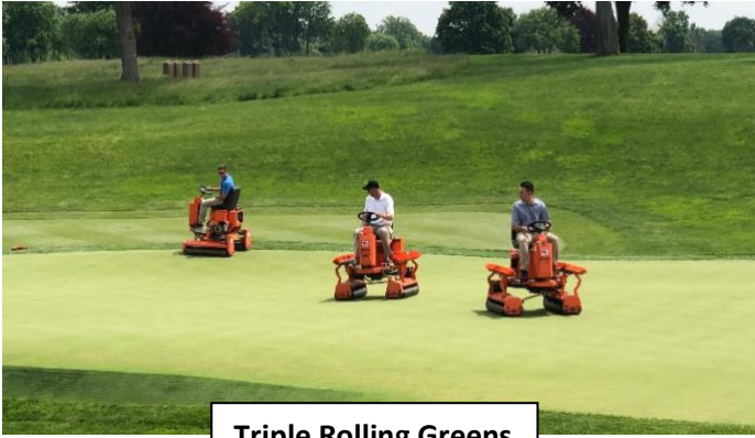
Triple Rolling Greens