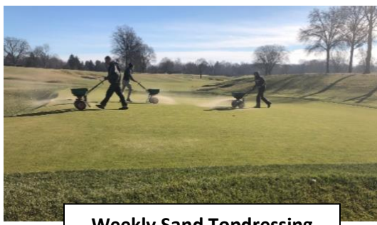
Weekly Sand Topdressing