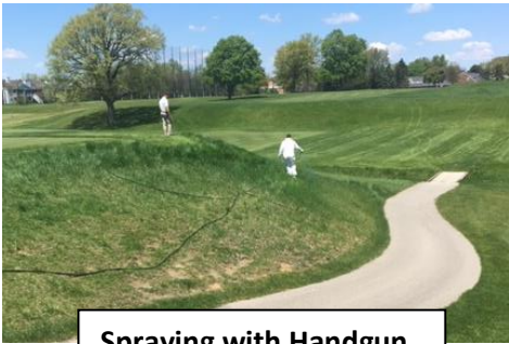
Spraying with Handgun