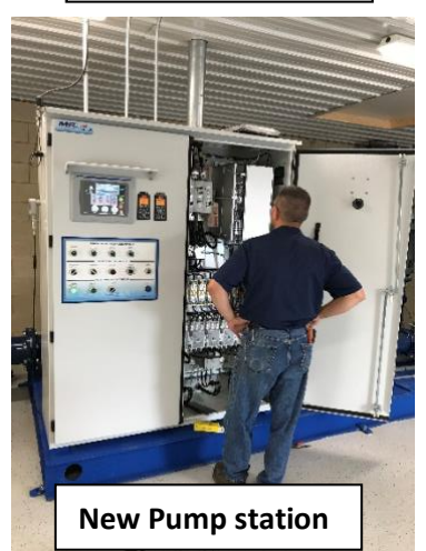
New Pump station