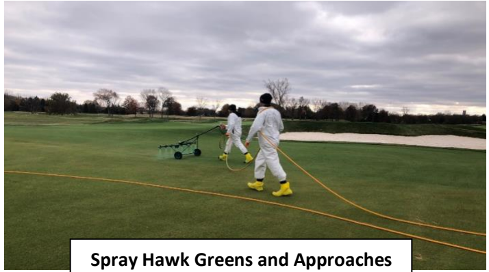
Spray Hawk Greens and Approaches